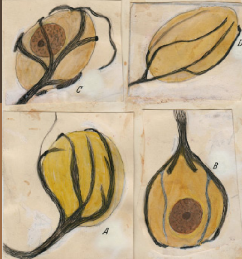
Artwork of Santiago Ramón y Cajal Gray Art Gallery - NYU Neuropathology

The Emory University School of Medicine is accredited by the ACCME to provide continuing medical education for physicians.