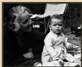
Melanie Klein with grandson 1938